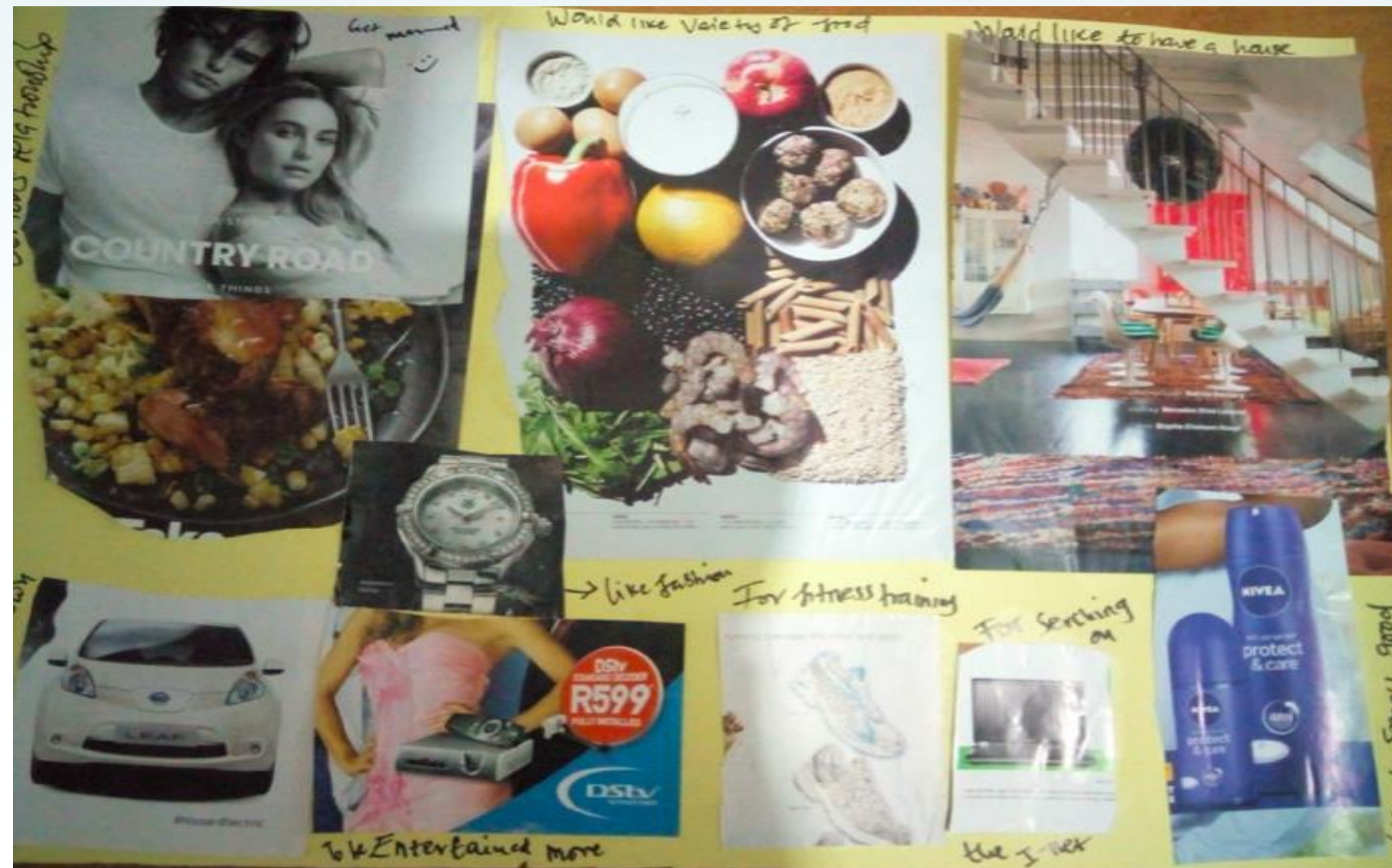
Figure 1. Collage created by YPLWH showing a description of themselves. This collage reflects a young man's future aspirations (marriage, cars, a nice house); maintaining health through good diet, personal hygiene and running; keeping time; and accessing the internet.